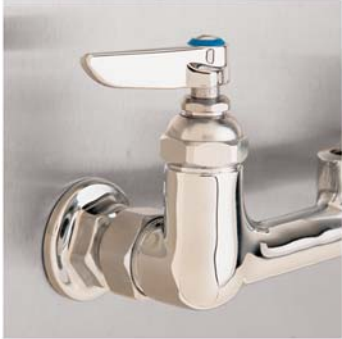
STEP 1 - Do NOT remove sink from wall. Locate connecting nuts.