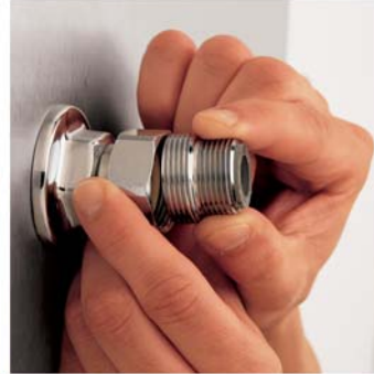
STEP 3 - Place new washer into fitting. Thread in Fisher EZ-Install Adapter.