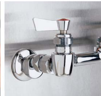
STEP 4 - Thread new FISHER Control Body on to EZ-Install Adapters, and tighten. (Discard eccentrics/concentrics supplied with new units.)