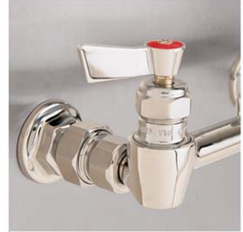
STEP 4 - Thread new FISHER Control Body on to EZ-Install Adapters, and tighten. (Discard eccentrics/concentrics supplied with new units.)