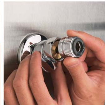
STEP 3 - Place new washer into fitting. Thread in Fisher EZ-Install Adapter.