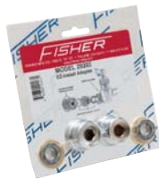
#29203 EZ-Install Adapter for T&S, Component Hardware and Dormont