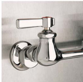
STEP 1 - Do NOT remove sink from wall. Locate connecting nuts.