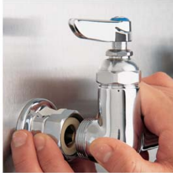
STEP 2 - Remove old control valve by unthreading nut.